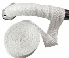
EXHAUST THERMAL WRAP 50MM x 10MM