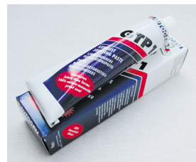
EXHAUST JOINTING PASTE