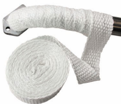
EXHAUST THERMAL WRAP 50MM x 10MM