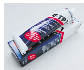
EXHAUST JOINTING PASTE