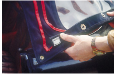
Extra length valances