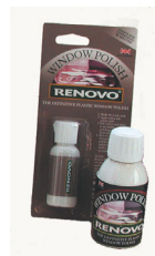
RENOVO PLASTIC REAR SCREEN POLISH