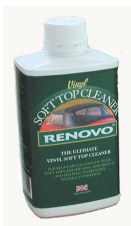
RENOVO VINYL CLEANER (500ml)