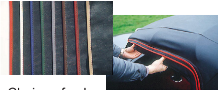
Choice of colour bindings