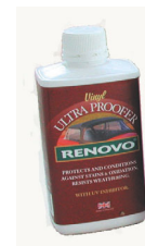
RENOVO VINYL PROTECTOR (500ml)