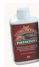
RENOVO VINYL PROTECTOR (500ml)