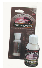
RENOVO PLASTIC REAR SCREEN POLISH