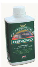
RENOVO VINYL CLEANER (500ml)