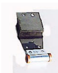
INTERMEDIATE EXHAUST SYSTEM FITTING KIT