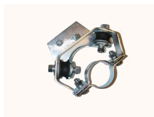
REAR EXHAUST SYSTEM FITTING KIT