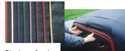
Choice of colour bindings