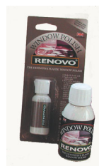
RENOVO PLASTIC REAR SCREEN POLISH