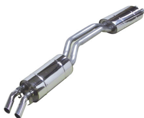
RV8 ORIGINAL STYLE STAINLESS TWIN SYSTEM