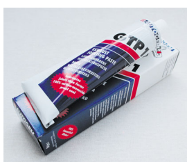
EXHAUST JOINTING PASTE