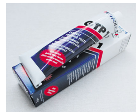
EXHAUST JOINTING PASTE