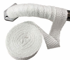
EXHAUST THERMAL WRAP 50MM x 10MM