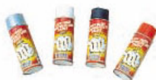
HIGH TEMPERATURE EXHAUST PAINTS