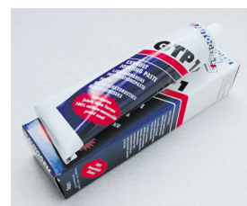
EXHAUST JOINTING PASTE