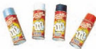
HIGH TEMPERATURE EXHAUST PAINTS