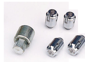
LOCKING WHEEL NUT SETS MGB, MIDGET OR MGB GT V8