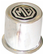
ORIGINAL ALLOY WHEEL CENTRE CAP MGB GT V8