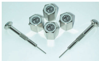
ANTI THEFT 'MG' VALVE CAP SET