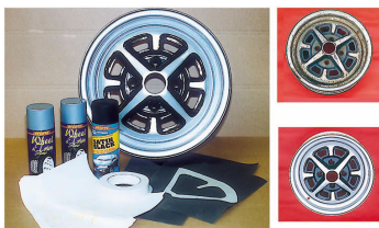
ROSTYLE WHEEL RENOVATION KIT MIDGET