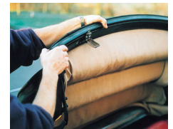
Hood fitting service available