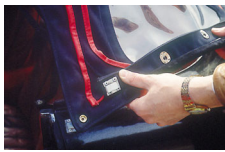
Extra length valances