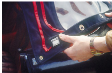
Extra length valances