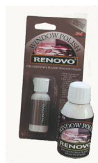
RENOVO PLASTIC REAR SCREEN POLISH