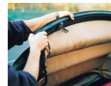
Hood fitting service available