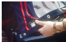
Extra length valances