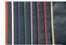
Choice of colour bindings