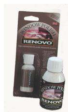
RENOVO HOOD SHAMPOO (300ml)