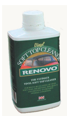
RENOVO VINYL CLEANER (500ml)