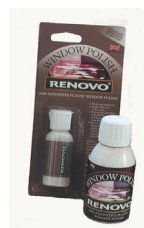
RENOVO PLASTIC REAR SCREEN POLISH