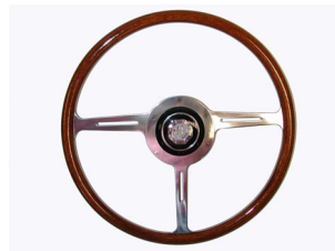
FACTORY OPTION STEERING WHEEL MGA