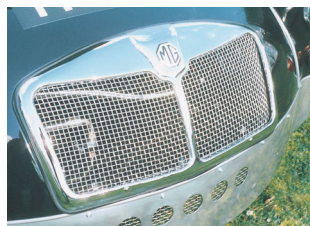
STAINLESS SUPERSPORTS GRILLE MESH MGA