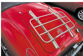
BOLT ON BOOT RACK MGA (STAINLESS OR CHROME)