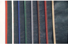
Choice of colour bindings