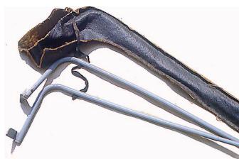
TONNEAU COVER STICKS BAG