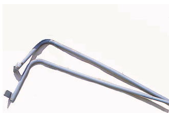
TONNEAU COVER STICKS (PAIR)