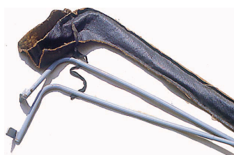
TONNEAU COVER STICKS BAG