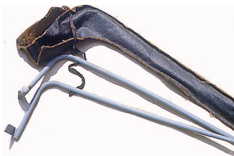
TONNEAU COVER STICKS BAG