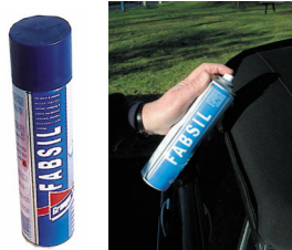
FABSIL WATER REPELLANT