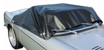
STORM COCKPIT COVER MGB & MGC