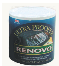
RENOVO HOOD ULTRAPROOF (1 LITRE)