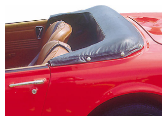
CLUB VINYL HALF TONNEAU COVER MIDGET