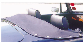
CLUB VINYL HALF TONNEAU COVER MGB