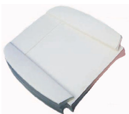
SEAT FOAM BACK MGB