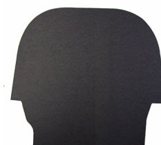
SEAT BACKBOARD MGB 1970-80