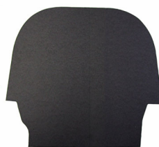
SEAT BACKBOARD MGB 1970-80