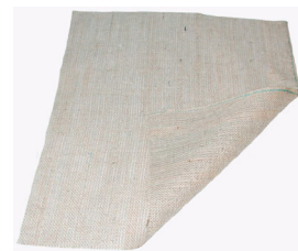
CALICO WEBBING COVER (EACH)