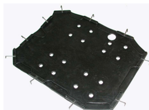
SEAT DIAPHRAGM MIDGET