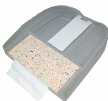
SEAT FOAM BACK MIDGET 1970-79