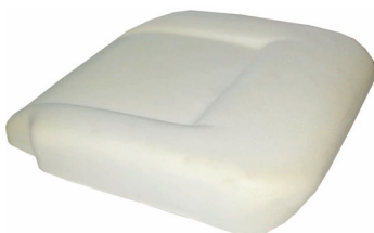
SEAT FOAM BASE MIDGET 1970-79