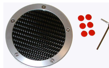
CARBON FIBRE TAX DISC HOLDER