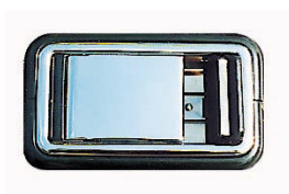
CHROME DOOR REMOTE (EACH)