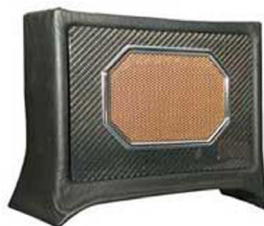
CARBON FIBRE SPEAKER CONSOLE PANEL MGB 1968-71