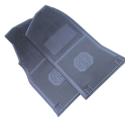
RUBBER FOOTWELL MATS MGB 1962-67