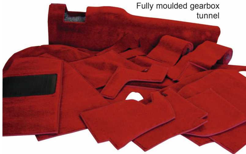
Fully moulded gearbox tunnel