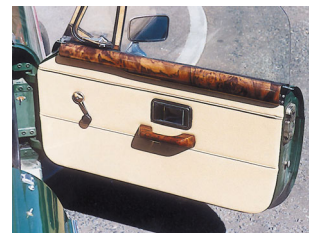
LEATHER CLASSIC PANEL SET MGB