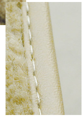
Top quality binding