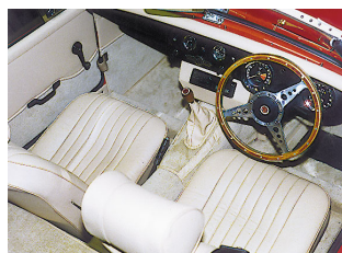
LEATHER SEAT COVERS MIDGET & SPRITE