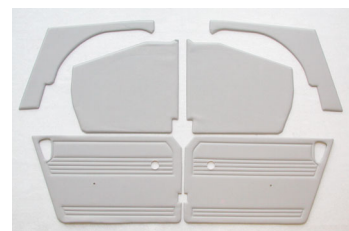
CLASSIC PANEL SET MIDGET & SPRITE 1970-79