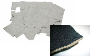
UNDERCARPET SOUNDPROOFING SET