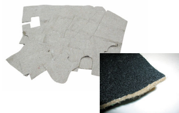
UNDERCARPET SOUNDPROOFING SET