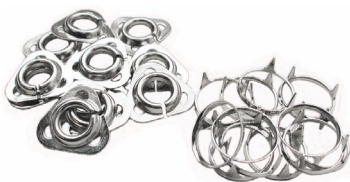
VELTEX CARPET CLIP SET MGB GT