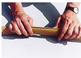
COCKPIT RAIL COVERING KIT MGB