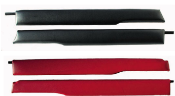
VINYL DOOR CAPPINGS MGB OR MGB GT