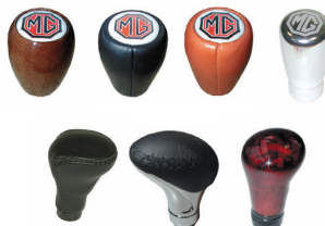
LEATHER, WOOD OR ALLOY GEAR KNOBS