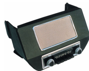
RADIO CONSOLE ASSEMBLY MIDGET & SPRITE