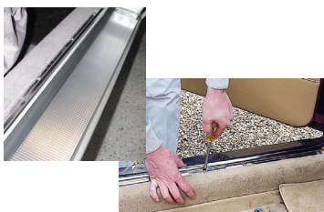
THRESHOLD PLATE/DOOR SEAL RETAINER SCREW PACK