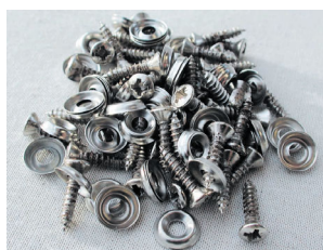
TRIM SCREW & CUP WASHER SETS MGB OR MGB GT