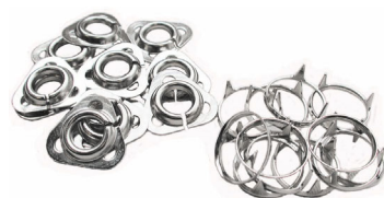
VELTEX CARPET FASTENER SET MGB