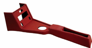
LEATHER CONSOLE WITH LEATHER PANELS MGB & GT