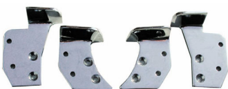
DOOR CAPPING BRACKET SET MGB ROADSTER