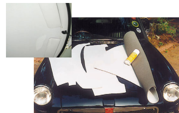
HEADLINING KIT MGB GT