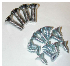
DOOR CAPPING BRACKET SCREW SET MGB & GT