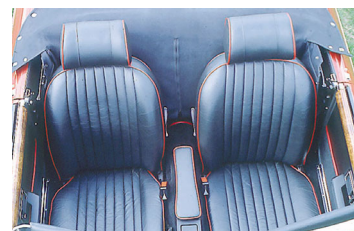
VINYL SEAT COVERS MGB & MGB GT 1970-73 (PAIR)