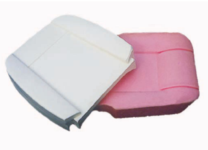
SEAT FOAM BACK & BASE MGB 1970-73 (EACH)