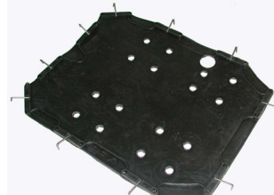
SEAT DIAPHRAGM MGB 1962-72 APPROX (EACH)