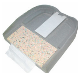
SEAT FOAM BACK & BASE MIDGET & SPRITE (EACH)