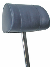
LEATHER HEADREST 'D' OR 'PEAR' SHAPE