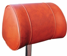
VINYL HEADREST 'D' SHAPE