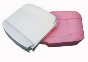
SEAT FOAM BACK & BASE MGB 1970-73 (EACH)