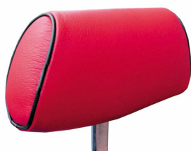
VINYL HEADREST 'PEAR' SHAPE