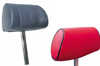
VINYL HEADREST 'D' OR 'PEAR' SHAPE