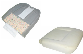
SEAT FOAM BACK & BASE MIDGET & SPRITE (EACH)