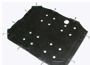
SEAT DIAPHRAGM MGB 1962-72 APPROX (EACH)