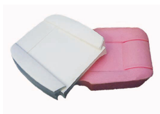
SEAT FOAM BACK & BASE MGB 1970-73 (EACH)