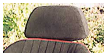
VELOUR HEADREST COVER 'PEAR' SHAPE