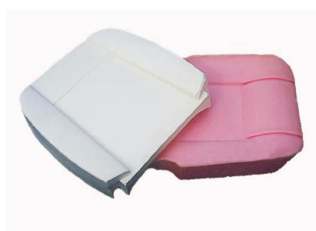
SEAT FOAM BACK & BASE MGB 1973-80 (EACH)